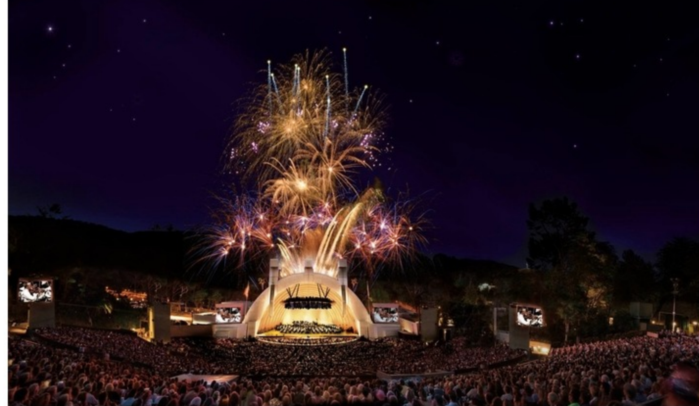
Fireworks Spectacular

The party doesn't end when the street festival closes. A massive free concert featuring Gustavo Dudamel, the Los Angeles Philharmonic, and very special guests – including Katy Perry, Herbie Hancock, Kali Uchis, Youth Orchestra Los Angeles (YOLA), and more – will take over the Hollywood Bowl starting at 7pm. This ticketed event is separate from the LA Phil 100 x CicLAVia festivities. Register now for a chance to attend this once in a lifetime concert!