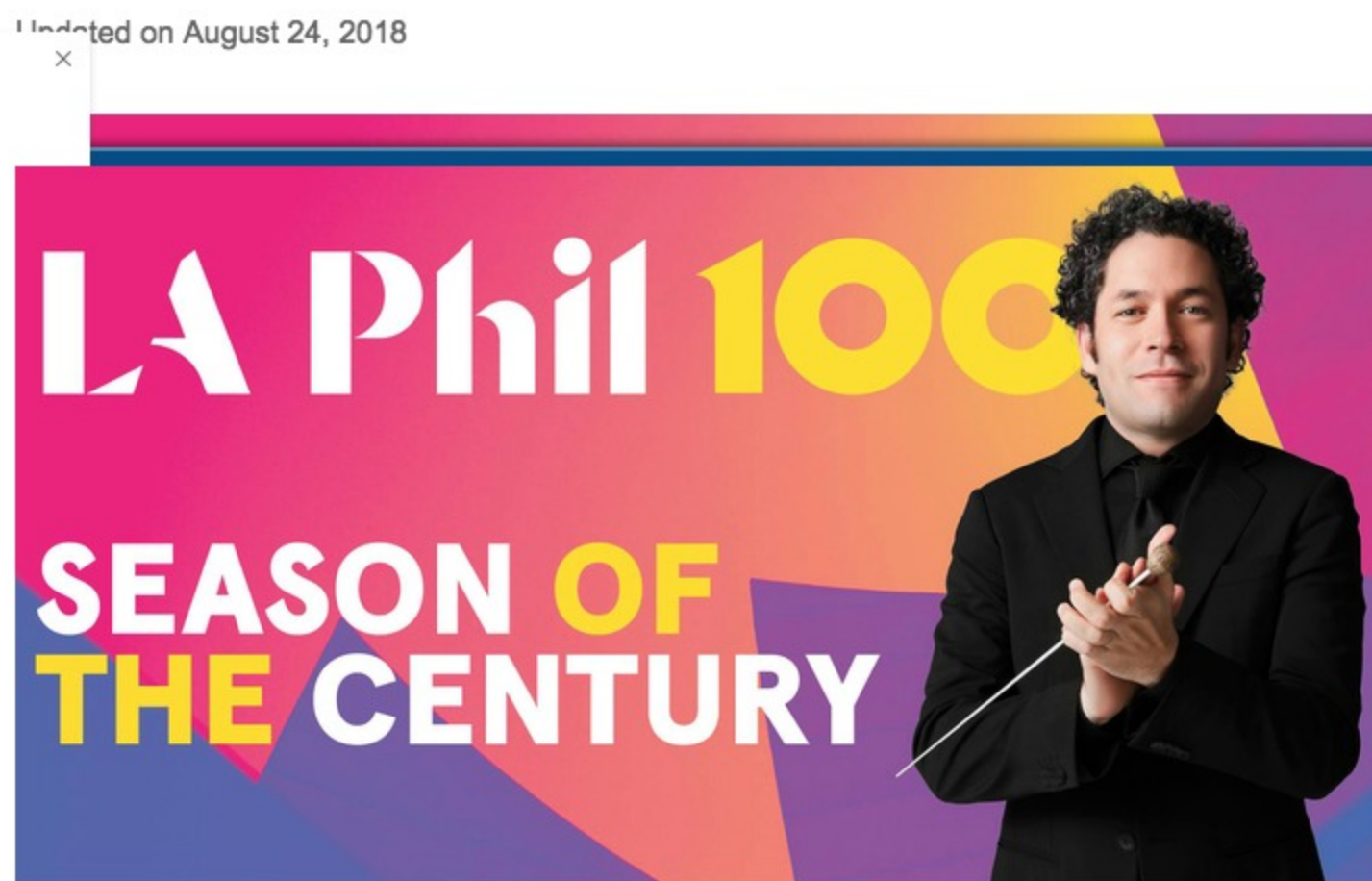
LA Phil 100: Season of the Century enlarge photo [+]

On Sunday, Sept. 30 the LA Phil kicks off its centennial season with Celebrate LA! , a FREE celebration with hundreds of musicians, artists, dancers, family activities and more.